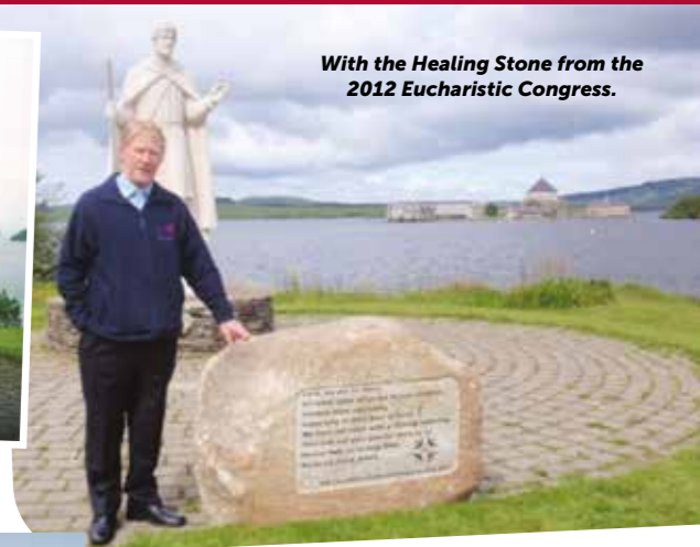
With the Healing Stone from the 2012 Eucharistic Congress.

pilgrims and staff, his deep compassion and his great welcome for all who came to Lough Derg. Without a doubt, his greatest ministry was in the Sacrament of Reconciliation. He literally embraced the penitent and their story; he gave them a profound assurance of God's love and mercy; he listened with the ear of the heart.