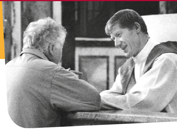
In the Basilica at the Sacrament of Reconciliation.

“Lough Derg as a place of pilgrimage and as a living being needs to continue to be bold, stepping forward in order to not only survive, but flourish. To become known and prosper as a sustainable organisation synonymous with accomplishment and appeal – becoming famous ‘for being with you on life's journey and bringing the gift of hope’.”