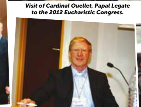
Representing Lough Derg at the European Pilgrimage Congress in Lourdes 2007.