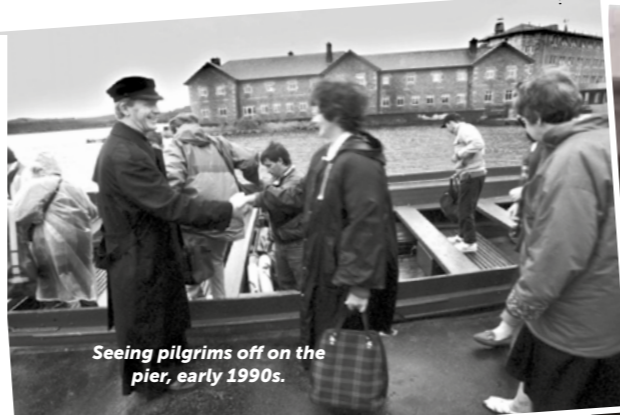
Seeing pilgrims off on the pier, early 1990s.

“On the face of it Lough Derg might be expected to be a gloomy place. But it's not. Never! It's a heart-warming place, it's a place of great optimism. There is great camaraderie. Life is a joy not a burden. You always meet someone who is worse off than you and they give you a sense that you are not so bad after all!”