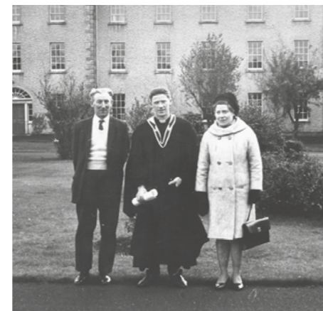
With his parents at Maynooth on Graduation Day 1966.