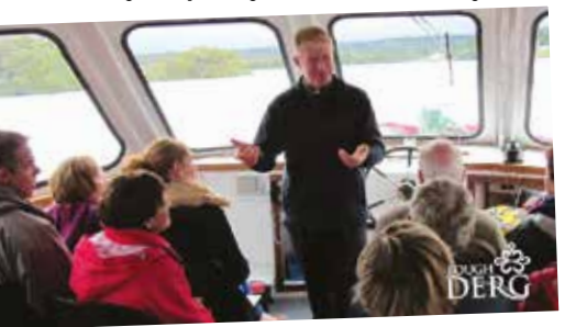
Bidding the Pilgrims farewell on board the M.V. St Davog.

“One of our biggest challenges at Lough Derg is the dilemma of being dynamic and meeting the needs of today's society, while respecting the tradition of the past. In order to renew our ‘shrine’, we have embraced modern marketing mediums and utilised technology, not for the sake of it, but recognising that it is the way forward - we must meet people where they are - and maybe that's another strong message for all of us.”